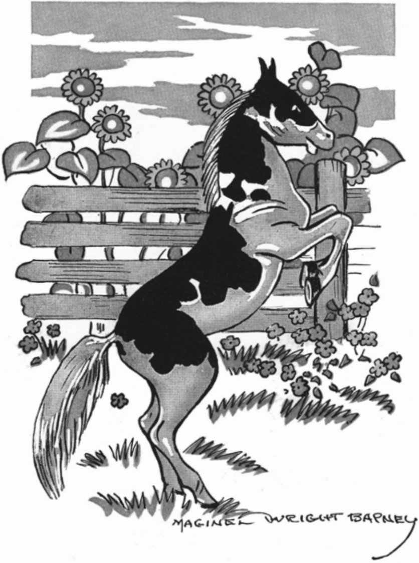
Round and round and round he turned in a dance. (page 27)